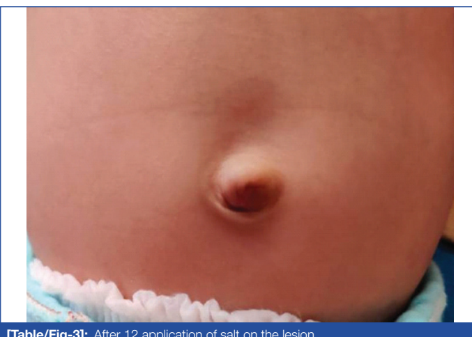
[Table/Fig-3]: After 12 application of salt on the lesion.

As per the records, the patients were reviewed in outpatient department after one week of first session of salt application. The data were categorised for the sake of analysis into: